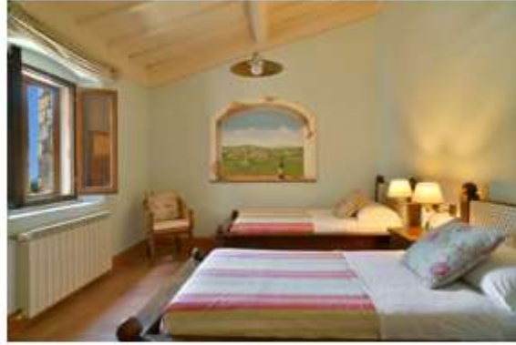
RICASOLI (queen + twin)