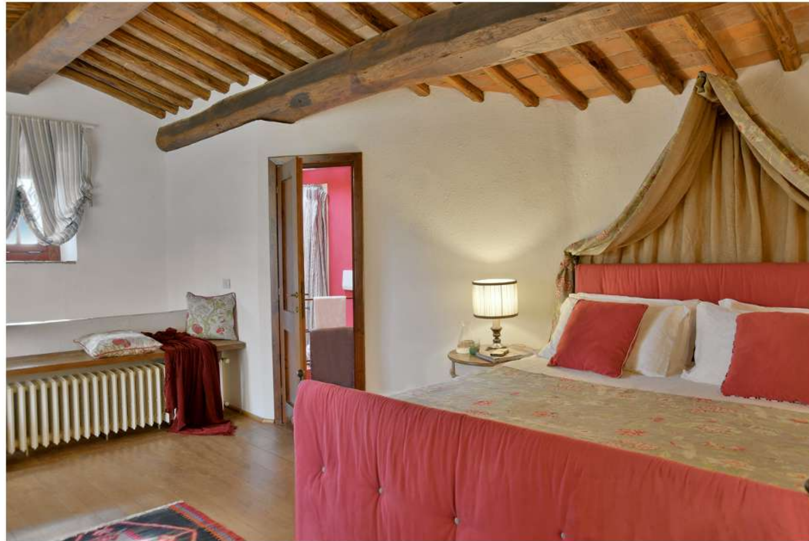
BUSSOLA (King bed)