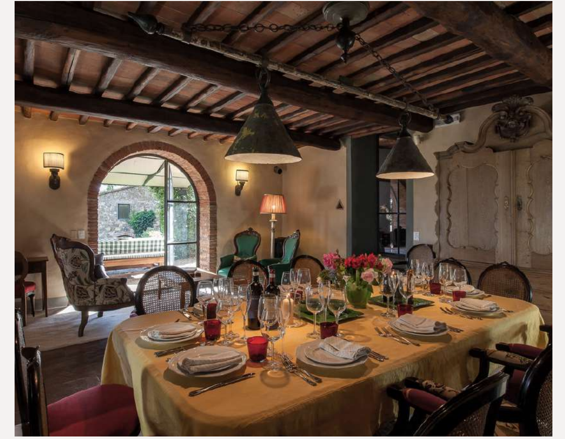
3 DINING ROOM