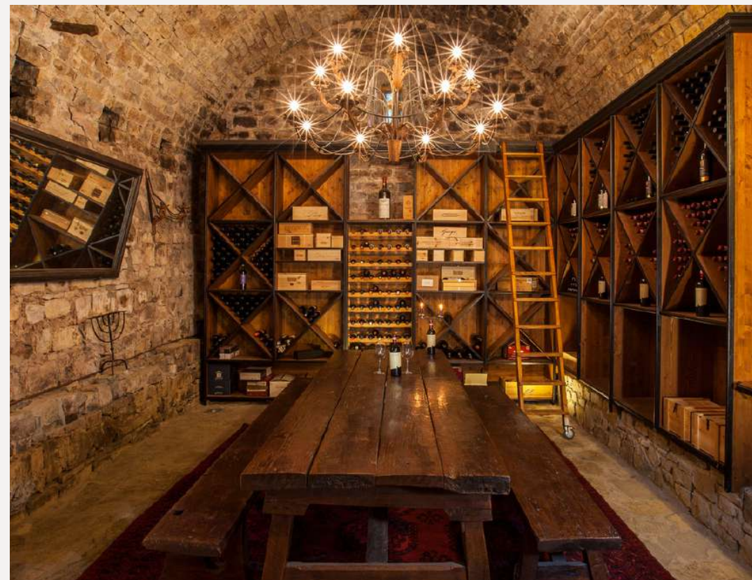
5 WINE CELLAR