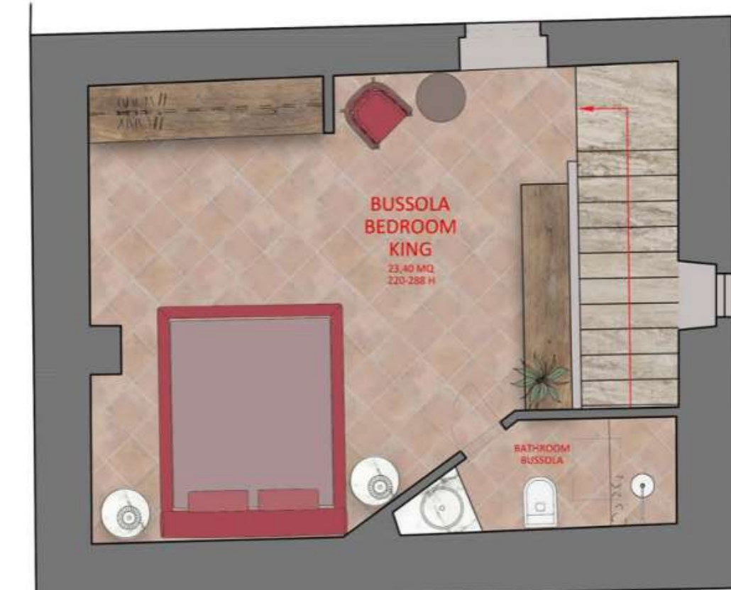
TOWER 4TH FLOOR