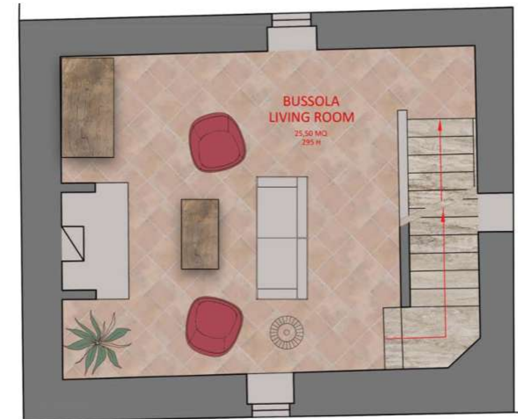
TOWER 3RD FLOOR