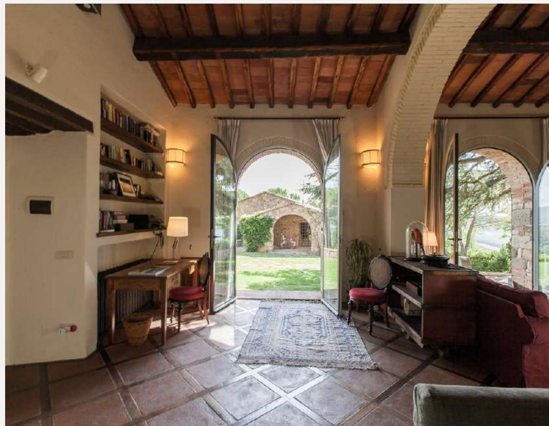
4 LIVING ROOM