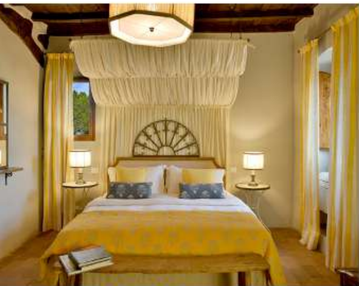
LUCERTOLA (King bed)